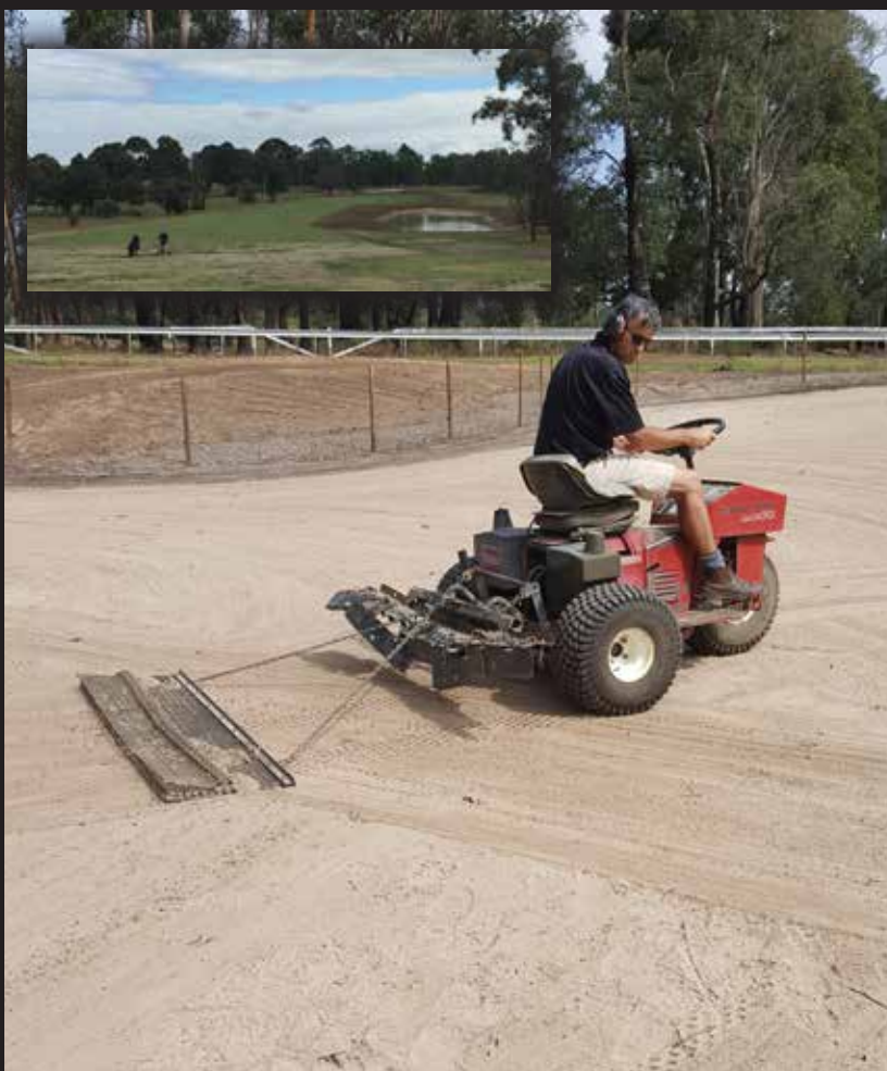
Above photo - Paul Reeves finalising green shape

This 1st stage is almost complete with only the grassing works on hole 7 to be completed. PCD has worked with the club a local earthmoving company and golf course drainage company to ensure the works could be completed prior to winter and within a tight budget. The on-site storage capacity is will now be over 40 megalitres (when stage 2 is complete) over 3000 lineal meters of drainage was installed and 7 is now a medium length par 5 played around a large lake to a green framed by 2 magnificent lemon scented gums.