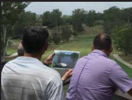
Team reviewing flood situations

Technically, this must be one of the most complex projects PCD have been involved in but the end result will be a significant improvement to the area on many levels and a great new public golf asset for the people of Brisbane.