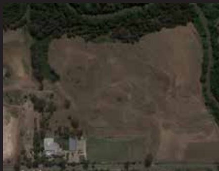
Aerial view of redeveloped old tip site