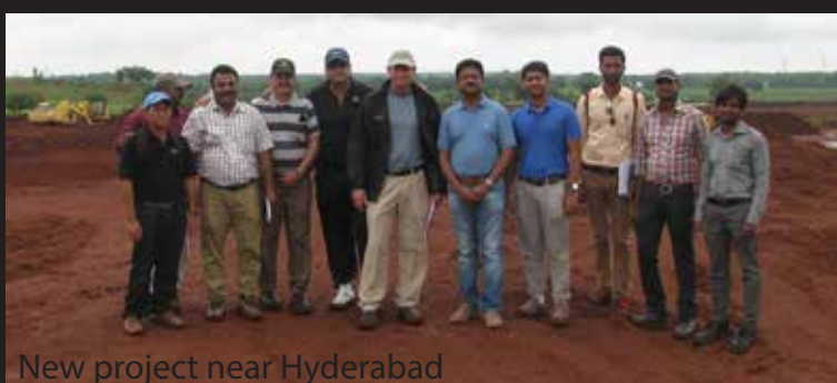
New project near Hyderabad