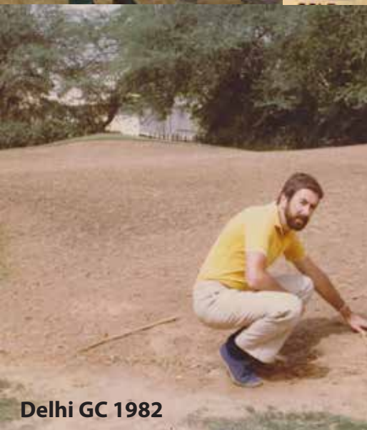
Delhi GC 1982