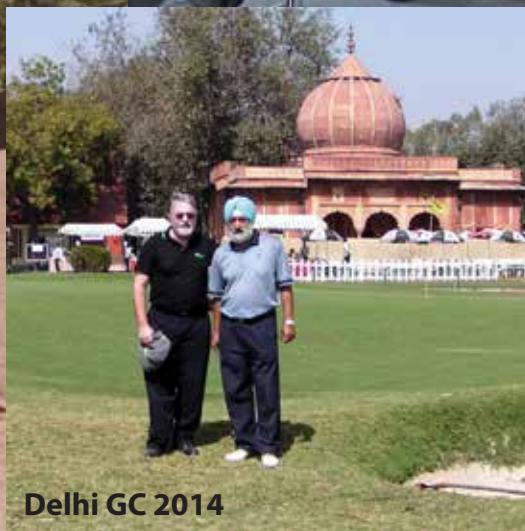
Delhi GC 2014