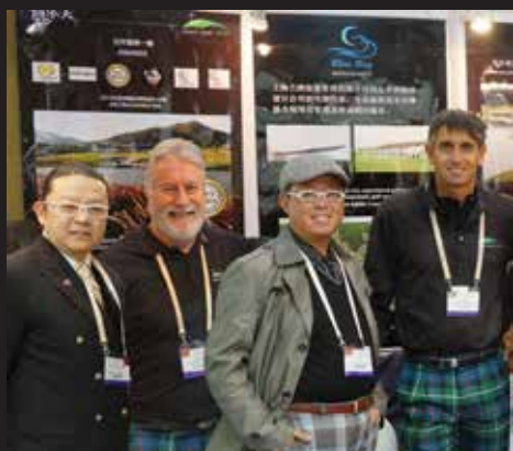
Team Bluebay / PCD on the left