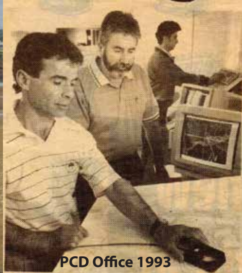
PCD Office 1993