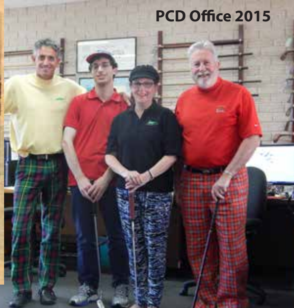
PCD Office 2015